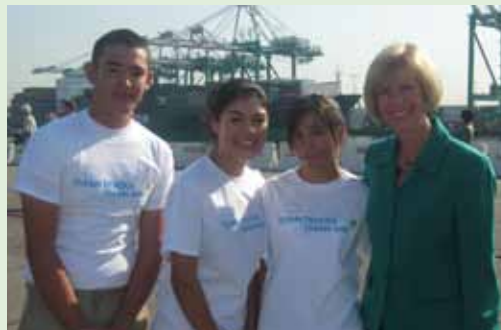
Janice Hahn and students from Port of Los Angeles High School talking about the Clean Trucks Program at the Port of Los Angeles