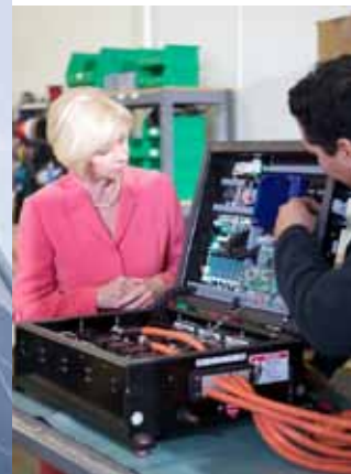
Janice Hahn at Balqon Corp learning about their electric drive technology

I am absolutely committed to turning around wrong-headed Washington policies that prioritize war over our economic security here at home. I will fight to restore the $108 million dollars for job creation and small business assistance recently cut by the U.S. Congress. We have spent more than a trillion dollars on the wars in Iraq and Afghanistan – surely we can afford to create more jobs here.