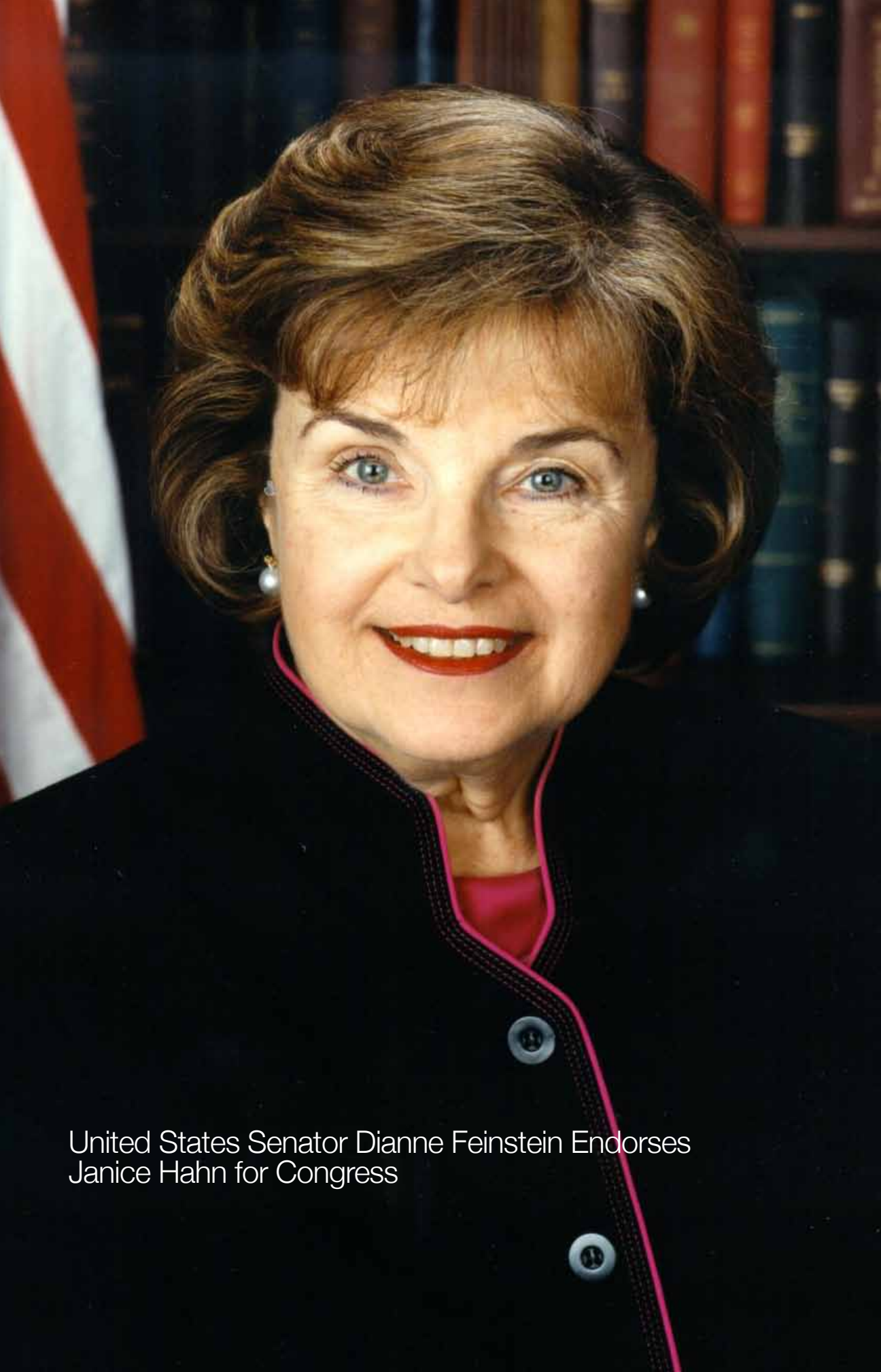
United States Senator Dianne Feinstein Endorses Janice Hahn for Congress